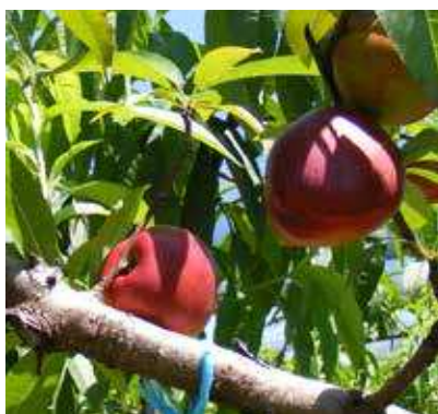
Q32-59 Nectarine.