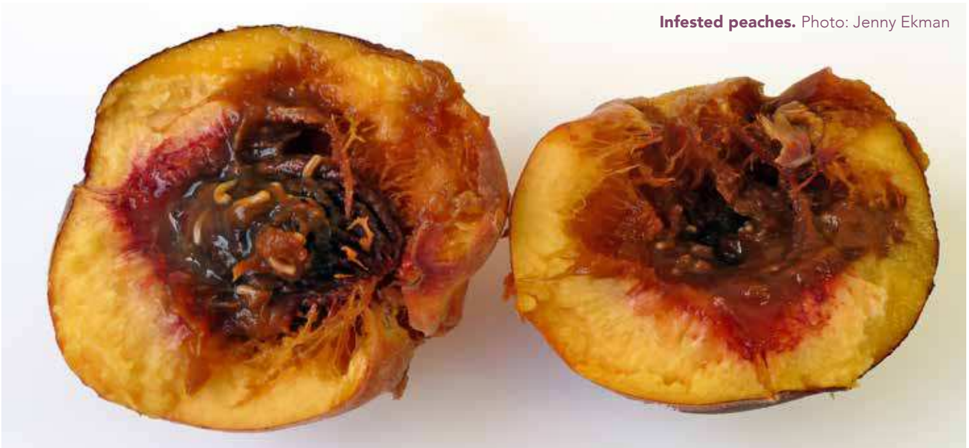
Infested peaches.