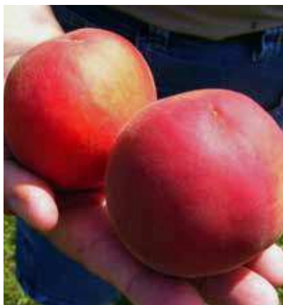
Q217 Peach.