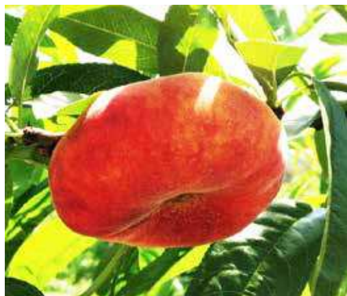
Flat peach.