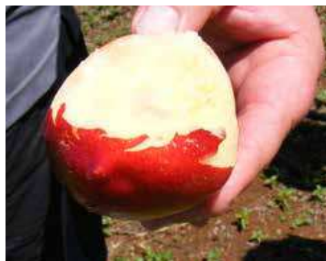
Q223 Nectarine.