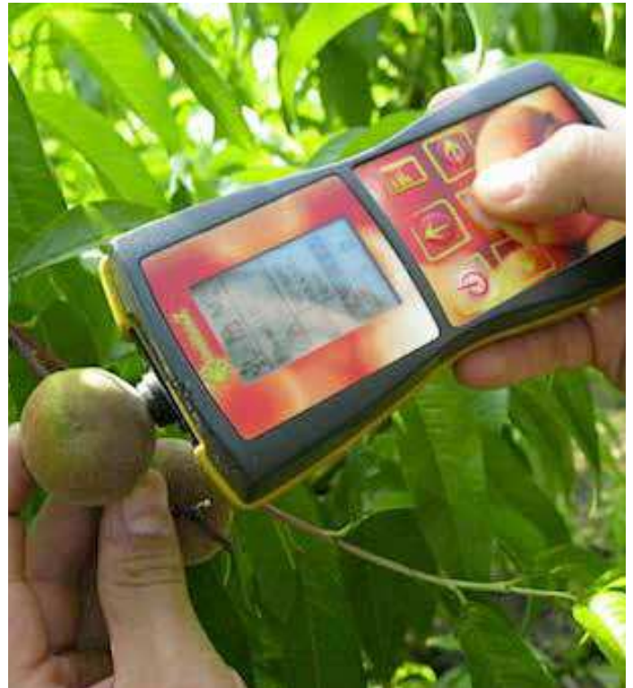
The DA meter can be used to track how fruit are developing and maturing on the tree.

” The DA meter is an innovative instrument for non-destructively determining a fruit maturity index by measuring the decline in chlorophyll content immediately below the skin during ripening. “