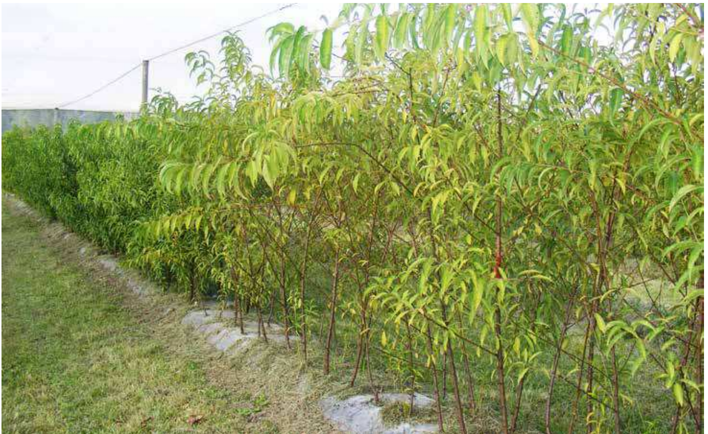
Local peach seedling population in the foreground followed by the Nieve seedling population. Note the smaller tree height and denser foliage of the Nieve.

Research Facility, phone 07 54535973 or email b.topp@uq.edu.au