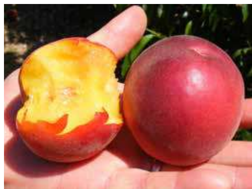
Q113-21 Peach.