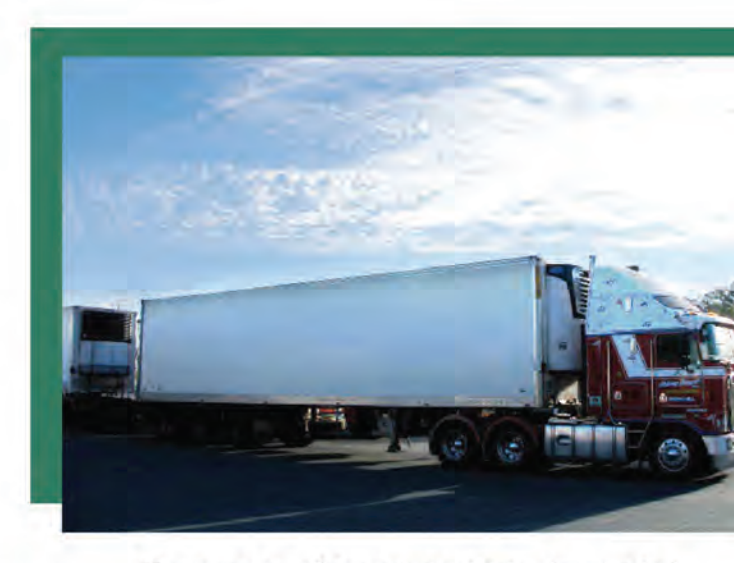
Transport in refrigerated vehicles (pantechs)

Transport in a refrigerated vehicle at 0 °C to 2 °C to maintain shelf life and quality.