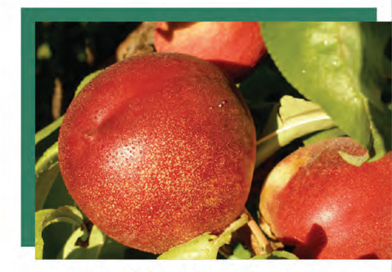
Speckled nectarines are the sweetest.

Summerfruit are particularly sensitive to being stored between 2 °C and 8 °C. Doing so may result in storage disorders.